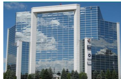
March 2018 Portfolio