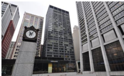
20 South Clark 1

The REIT has acquired $500M of assets in 2018