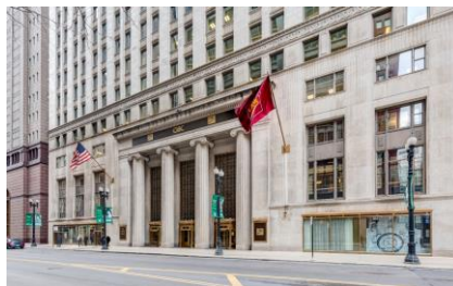
120 S LaSalle 1